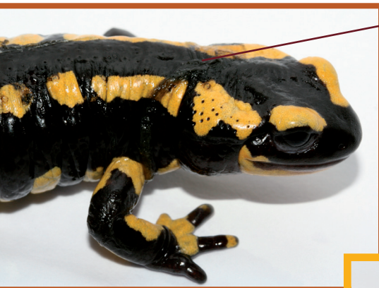
This fire salamander suffers extensive shedding of the skin

Metamorphosed salamanders and newts often show multifocal superficial erosions (holes in the skin) and extensive epidermal ulcerations (ulcers on the skin) all over the body. The animal may also suffer from anorexia (stop eating) and ataxia (muscle spasms) and show excessive shedding of the skin. Ultimately the animal dies.