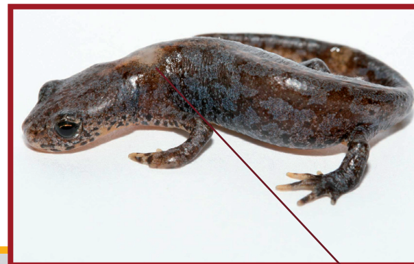
In this heavily infected fire salamander, the erosions and shedding is clearly visible